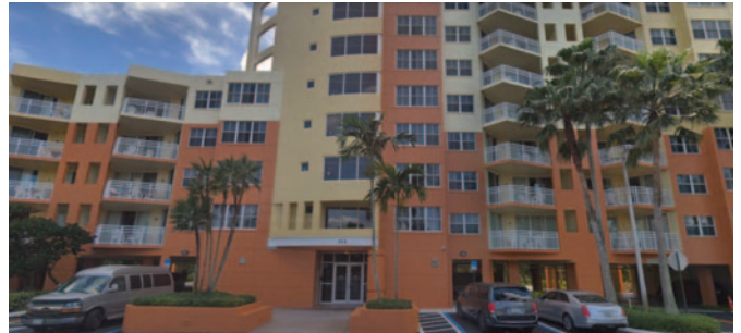
EFC Construction Corporation operated from an apartment in Weston in Broward County, according to Florida State corporation filings